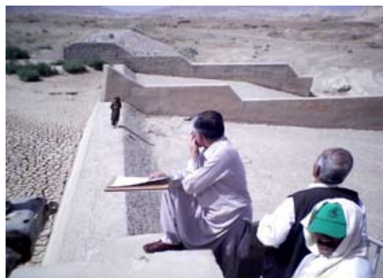
Figure 2 Weir structure, head regulator and canal at Shabo Headworks, Pishin district, Balochistan.

has a long history. Bunds as old as 5000 years have been found in Khuzdar district in Balochistan, suggesting that a complex organization existed at that time to operate and maintain the systems. Many of the sites of earliest habitation – Mehrgahr in Balochistan and several sites in DG Khan - are places where ephemeral rivers discharge onto plains – the same places where spate irrigation occurs at present. In Balochistan there are large and mainly unexplained ancient diversion bunds, the so-called gabar bandhs.