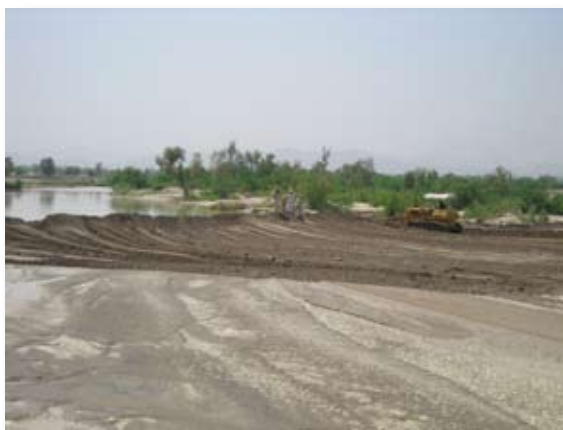
Figure 6 Bulldozer programme at work in Danghar Wali

only because of the challenges of managing sedimentation, dealing with occasional high floods and capturing shifting low flow canals.