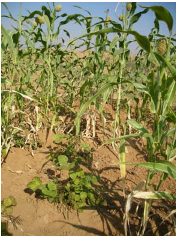
Figure 7 Multi crop Spate irrigation field with moong beans and sorghum

International experience is that modernization only works in certain cases and that in other cases improving traditional systems is more effective and economical both in investment and O&M cost. The cost of such improved traditional systems typically is in the range of USD 20-180/ha and concerns a range of interventions: using bed stabilizers, flow dividers and reinforcement of traditional earthen structures for instance. In Pakistan in most provinces a bulldozer programme has been in operation – providing earthmoving services at subsidized rates. This program has