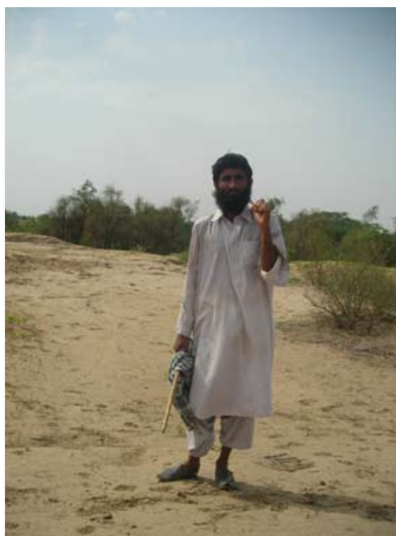
Figure 4 Spate farmer of D.I. Khan

The area cultivated in spate irrigation estimated from the Agricultural Census was 0.34 M ha in 1999-2000. This was however a drought year