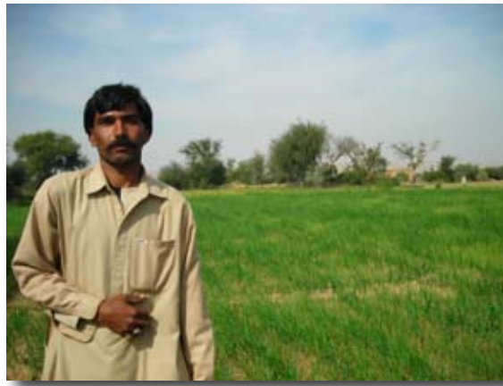
Figure 8 Improving productivity. Spate irrigated onion fields

Spate irrigation can address some of the major food security countries that Pakistan is facing and help regenerate livelihoods in areas where the poor-of-the-poorest are living. What is required is a concerted strategy and investment plan, making use of the different opportunities described above for extensification and intensification. Such a strategy should put farmer initiative and management centre stage, building on a long history of spate irrigation management by farmers and local government. As spate irrigation develops new and reinvigorated institutional arrangements are required and a protection of the rights of all riparians – building on existing and well-established traditions.