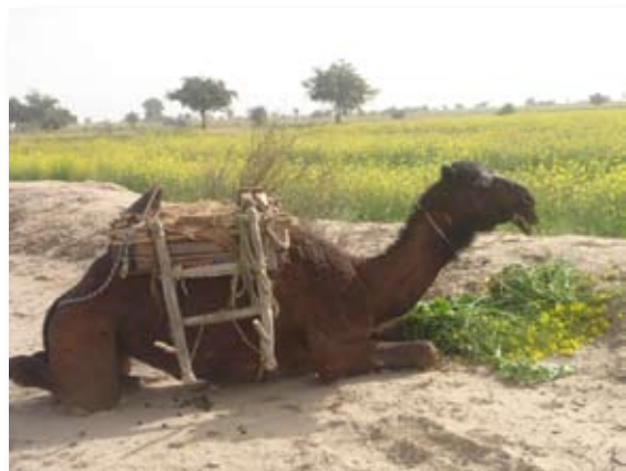
Figure 3 Spate irrigation: high potential for oilseeds and pulses

between the timing of watering and seeding. Another special feature of spate irrigation is the management of sediment. As sediment loads of spate flows may be as high as 10%, spate irrigation is as much about managing water and it is about managing sedimentation.