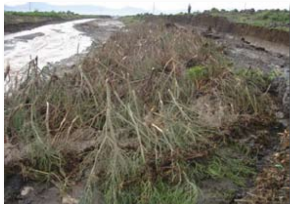
Figure 3 Traditional diversion structures in Hara, Tigray, Ethiopia (Haile, 2009).

Similarly in Aba’ ala in Tigray there are many waterways that run into farms. In total there are twenty-seven primary channels diverted from the three rivers. The diversion channels are made by digging an open channel both at the left and right banks of the rivers and strengthened by stone, boulders, shrubs and logs of trees (Figure 3). When there is flood almost all farms get water. Within the farms there are narrow furrows covering the entire field. These furrows distribute and can carry water for some time. The furrows are made in intimate succession to one another and slightly against the contour. Under a Norwegian Aid project some of these traditional intakes have been replaced with masonry walls.