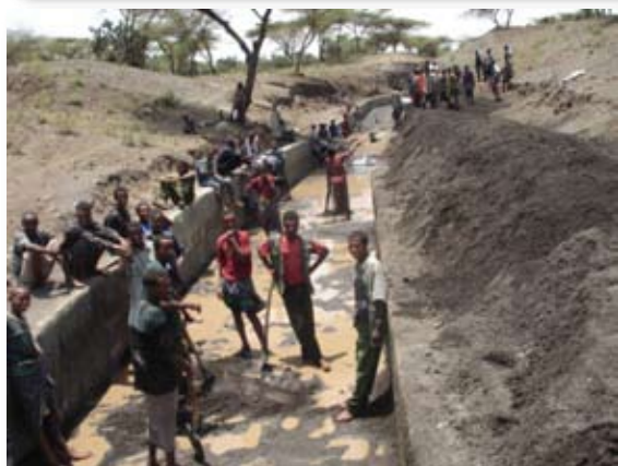
Figure 5 & 6 Sedimentation problem in Fokisa, Tigray, Ethiopia (Tesfa-alem, 2009).

hectare (Alemehayu, 2008). These costs are very reasonable and at par with 'sensible' investments in spate irrigation elsewhere (Mehari et al., 2010).