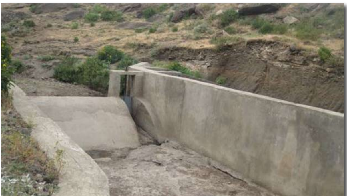
Figure 4 Modern diversion weir in Boru Dodota, Oromia, Ethiopia (Chukalla, 2010).

The cost for development of spate irrigation projects obviously varies from place to place. In remote area labour cost are low and locally available material may be used, but the cost of mobilization and demobilization of machinery make the projects expensive. The scale of projects also affects the cost. In modernized structures with civil works the community maintenance input is very low at not more than 10% and as a result the project cost is high. On the other hand, the local contribution in improved traditional spate irrigation systems is very high and this reduces public investments. As estimated from ongoing spate projects, the current construction cost of spate irrigation systems ranges from USD 170 to 220 per ha for non permanent headwork, including soil bunds, gabion structures and diversion canals and up to USD 450 for permanent headwork for small systems including diversion weirs and bunds. The costs of permanent headwork for large systems including diversion weirs, breaching bunds and siphons as estimated from one of the ongoing project (Koloba Spate Project) ranges from USD 330 to 450 per