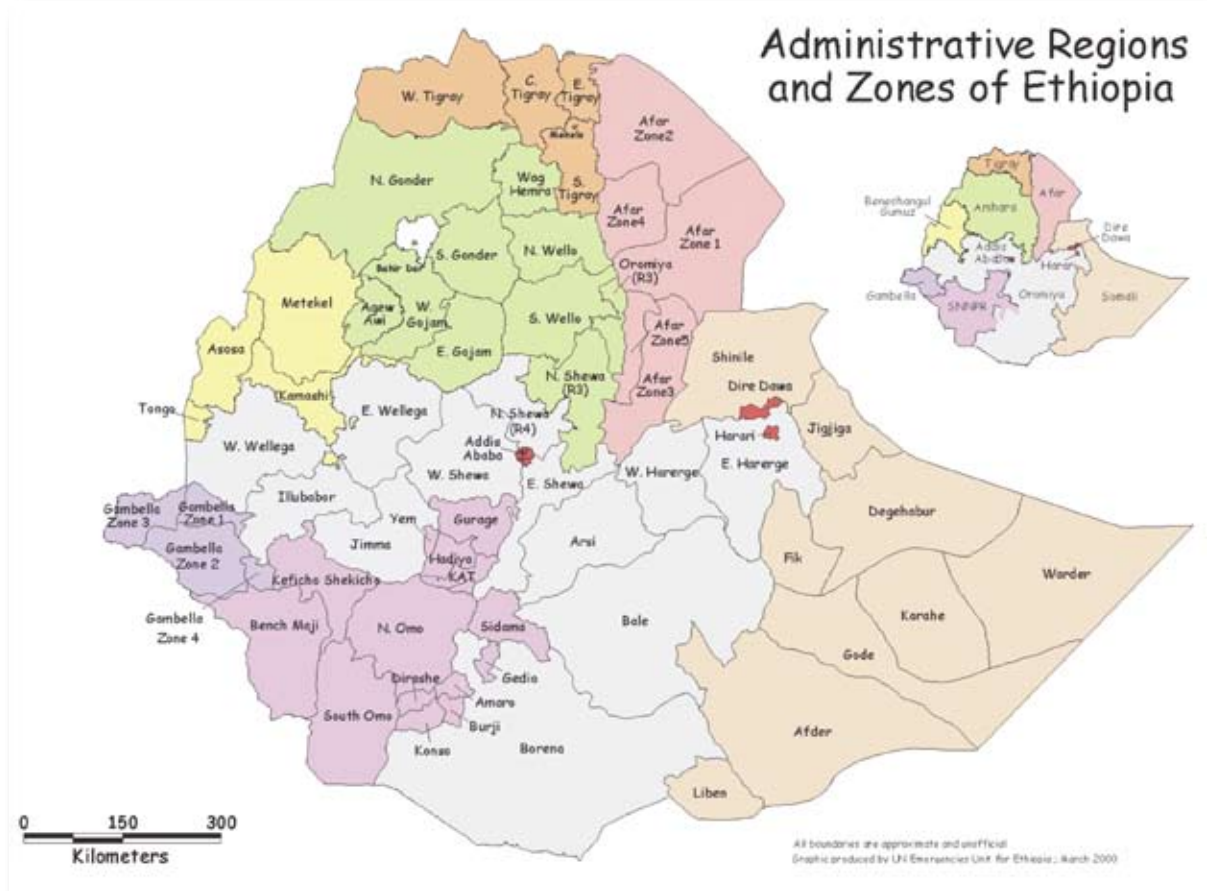
Figure 1 Detailed Map of Administrative Regions of Ethiopia showing the Zones where spate irrigation is being practiced (UNDP, 2002).

At present most spate systems are in the midlands and some in the lowlands. There are distinct differences between midland and lowland systems (Table 1). First is that in the midlands rainfall is higher and the spate flows complement and are complemented by rainfall. Command areas in the midlands are relatively small, defined by hill topography. Lowland systems on the other hand are larger, receiving water from a large mountain watershed. Lowland soils are alluvial and rivers are less stable. They may degrade, silt up or change course. In long established spate area - such as the western bank of the Indus in Pakistan or the Tihama plains in Yemen, farmers have developed traditional techniques (long guide bunds, brushwood deflectors) to manage these systems and come to productive resource management systems - integrating crop production and livestock-based livelihood systems. In Ethiopia at this moment spate irrigation development in lowland plains is still modest - and often limited