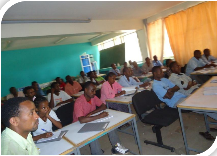
Participants attending during the training session