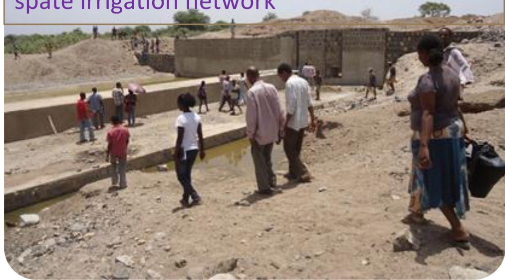
Participants visiting Spate irrigation scheme in Konso

The participants (30 in number) also watched and reflected on practical spate irrigation documentary video prepared for Sheab area, worked group exercise, present their findings and eventually they visited spate irrigation scheme at Konso. To this end half of the participants became registered member of Ethiopia chapter spate irrigation network