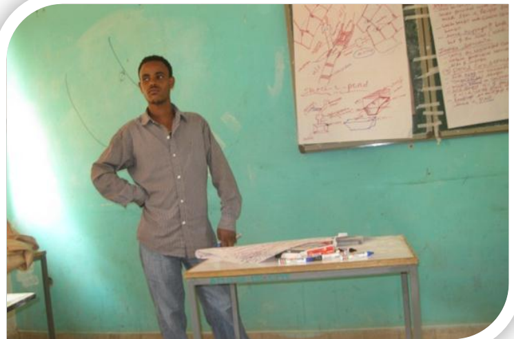
Participants presenting their group exercise result

The participants (30 in number) also watched and reflected on practical spate irrigation documentary video prepared for Sheab area, worked group exercise, present their findings and eventually they visited spate irrigation scheme at Konso. To this end half of the participants became registered member of Ethiopia chapter spate irrigation network